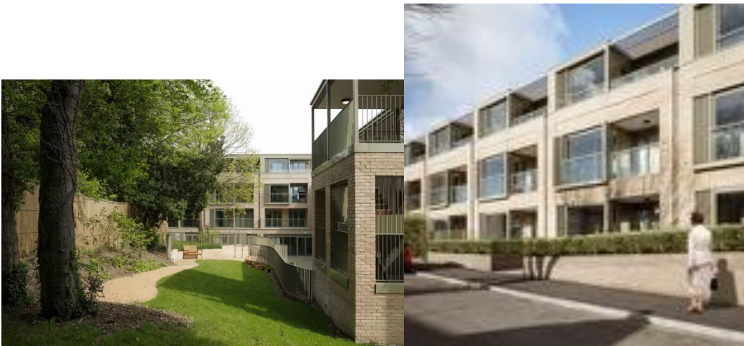
Windmill Court Extra Care Scheme: Pictures courtesy of Tim Crocker