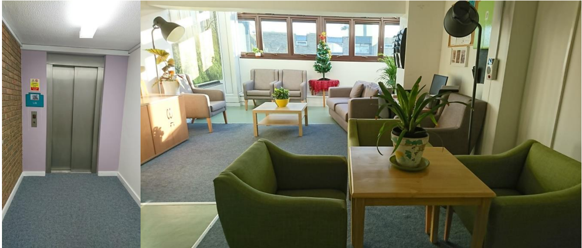
Kevan House - lift and hallway