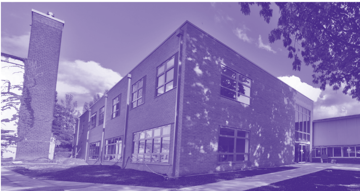
New facilities at Shaftesbury High School - Outstanding for children with Special Educational Needs'

A very successful 'I am Team GB' post Olympics event was held on 27 August 2016 at Harrow Leisure Centre, attended by over 600 people and in the finals of the London Youth Games at the beginning of July 2016, Harrow finished 19th out of 33 London Boroughs, only our second time in the top twenty.