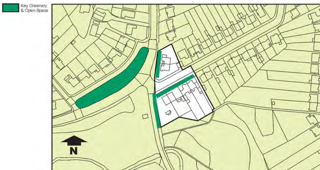
Picture 12.17 Greenery within front gardens and/or as boundary treatments.

where trees are threatened or their future retention is prejudiced. The Council will also consider making orders under any new powers that may emerge with respect to important hedgerows.