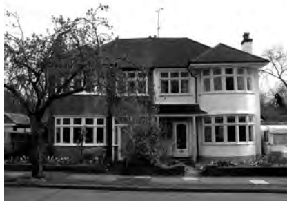
Picture 12.12 6&8 Birchmead Avenue