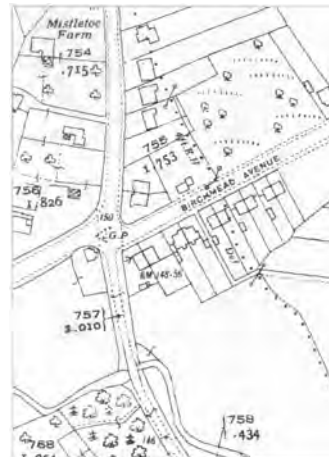
Picture 12.5 Map of 1932. LBH LA.100019206.2007