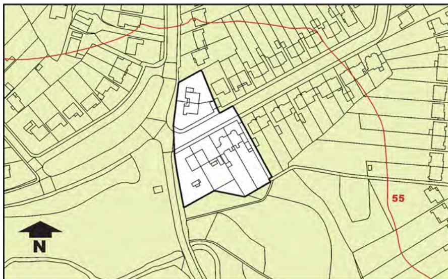
Picture 12.6 Topography. LBH LA.100019206.2007