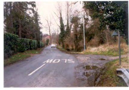
Picture 12.16 Semi rural setting