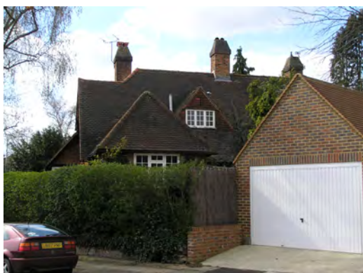
Picture 12.9 View towards Spindle Cottage