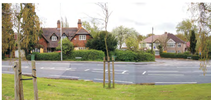
Picture 12.10 View into the conservation area across the green to the west