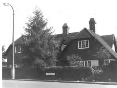
Picture 12.11 The Cottage and Spindle Cottage

12.25 Numbers 2 and 4 are of less architectural interest, although number 2 retains its original windows for the most part. Number 2's front garden does make a positive contribution however, having soft boundary hedging and a large tree to the front, which help to soften the transition between the open land on the other side of Cheney Street and the much 'harder' Birchmead Avenue.