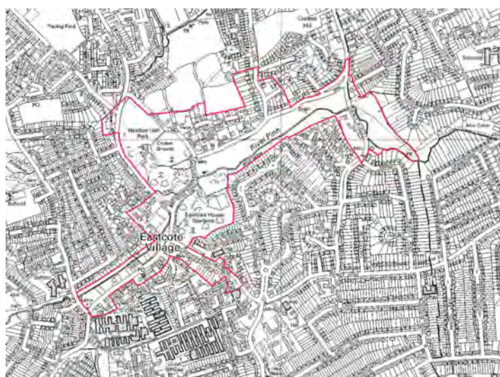
Picture 12.3 Eastcote Village CA within the whole of the conservation area, which is largely located within Hillingdon LBH LA. 100019206.2007