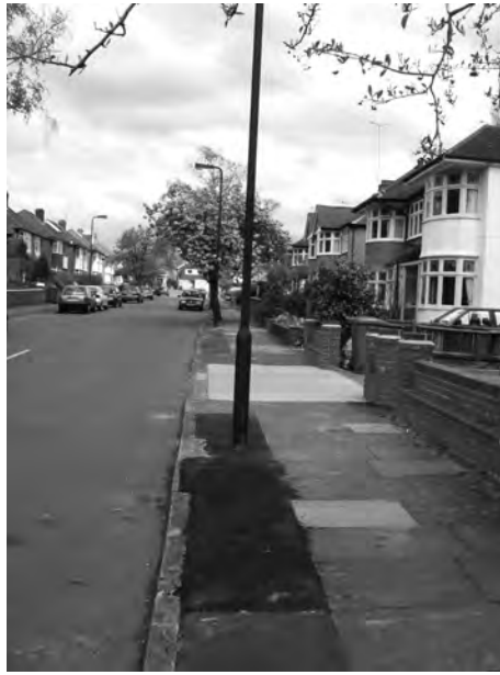
Picture 12.7 Birchmead Avenue