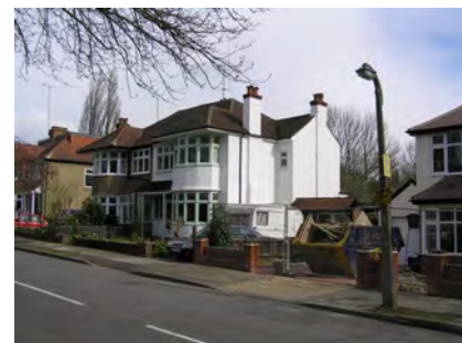
Picture 12.13 4,6 and 8 Birchmead Avenue