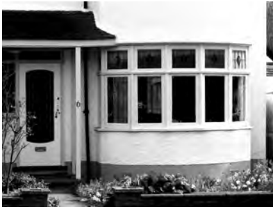
Picture 12.14 Bay windows and leaded lights

12.26 Clay roof tiles are typical of the area as are original leaded lights to white painted timber windows. Red brick in Flemish bond or white rendered buildings are common. Tall chimneys and half timbered details are common and important as they create an Arts and Crafts character. Bay windows are common in the area and make an attractive feature.