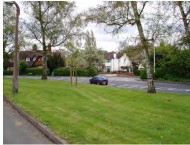
Picture 12.15 Green setting