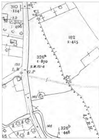
Picture 12.4 Map of 1913.

12.15 The Circuits was demolished in 1957. The main great houses were demolished in the 1960s but their grounds survive and are vital to the character of the area, helping to maintain some of the openness and informality of the areas rural past.