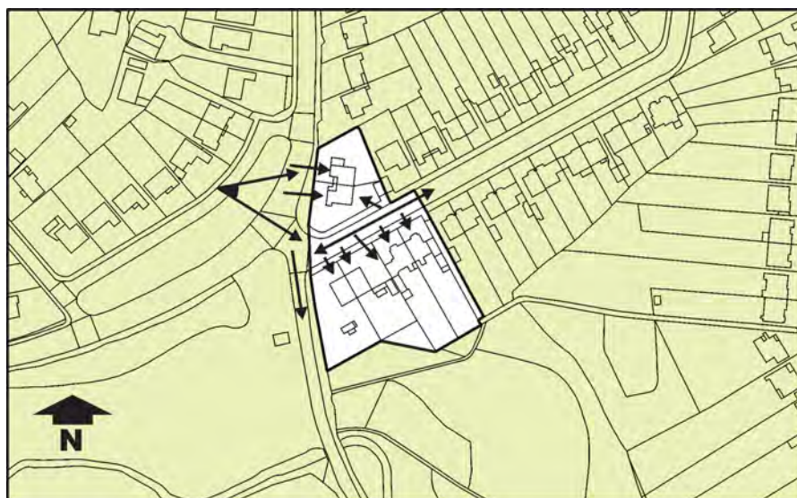
Picture 12.8 Key Views. LBH LA.100019206.2007