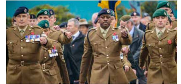
The 131 Commando Squadron Royal Engineers led the parade from the town centre to the Civic Centre, joined by the Royal British Legion, cadets, Scouts, volunteers and other organisations