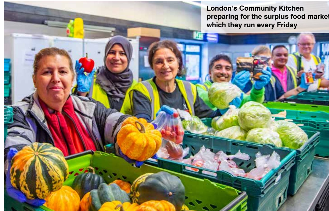
London's Community Kitchen preparing for the surplus food market which they run every Friday