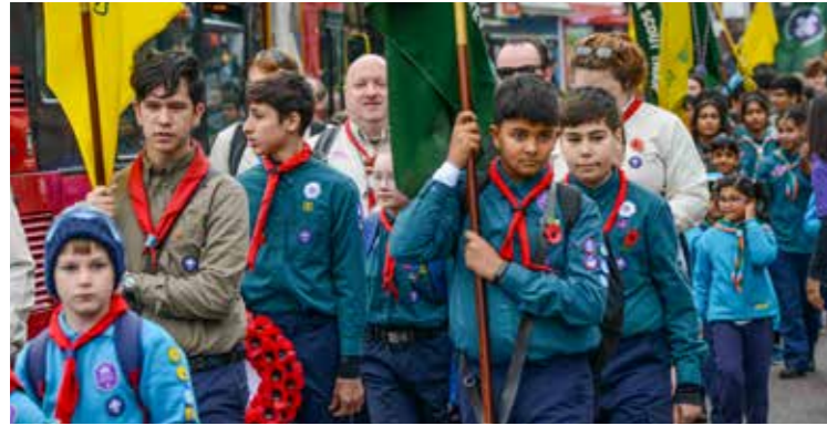
Harrow Scouts join the parade and lay wreaths