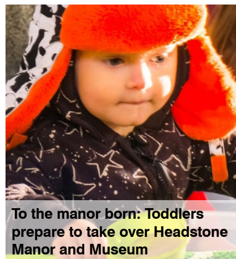
To the manor born: Toddlers prepare to take over Headstone Manor and Museum