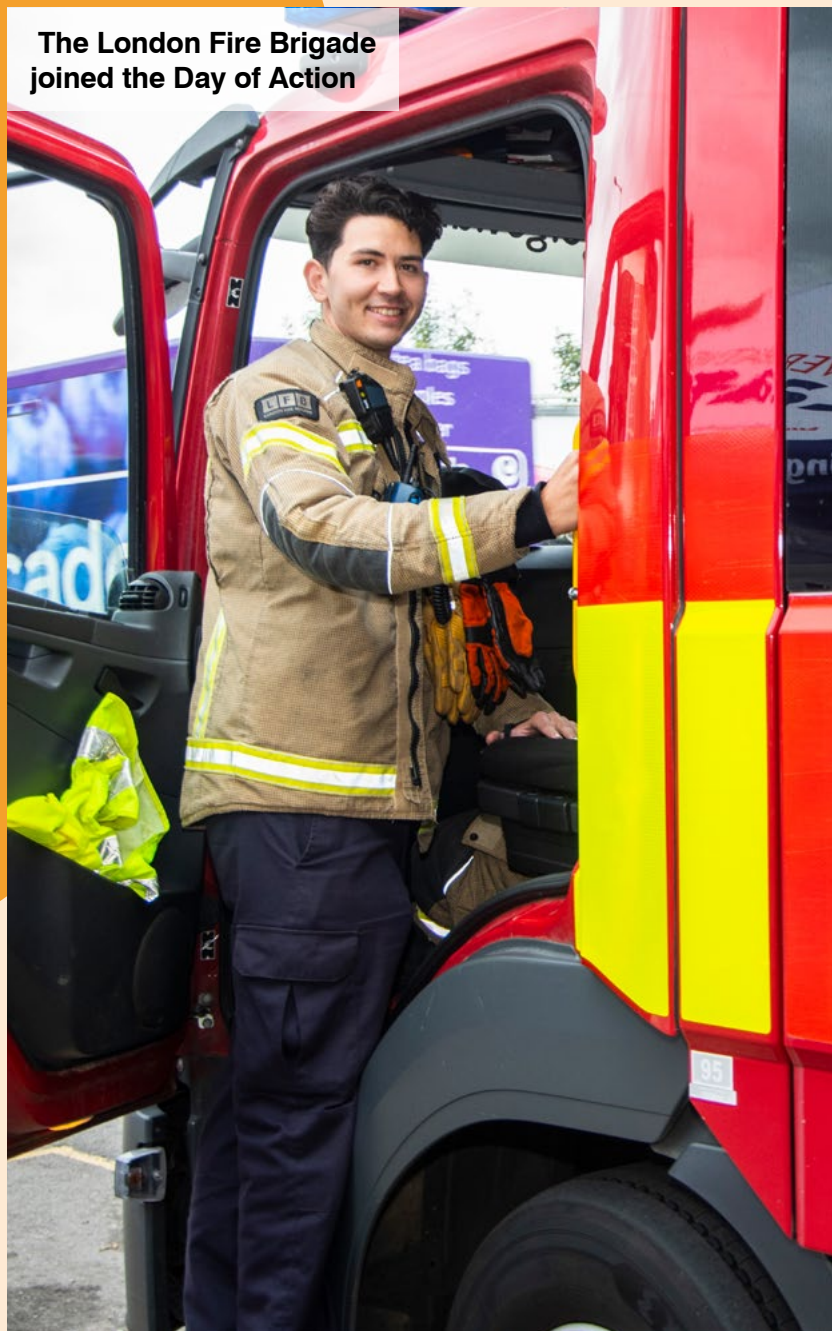
The London Fire Brigade joined the Day of Action