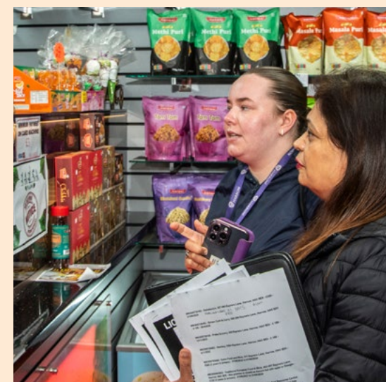
Trading Standards were out in force

Our thanks go to all the teams who helped make the day a great success.