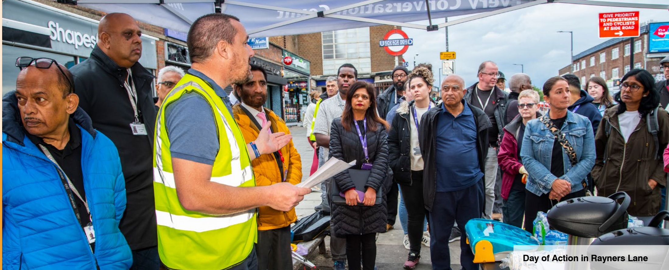
Day of Action in Rayners Lane