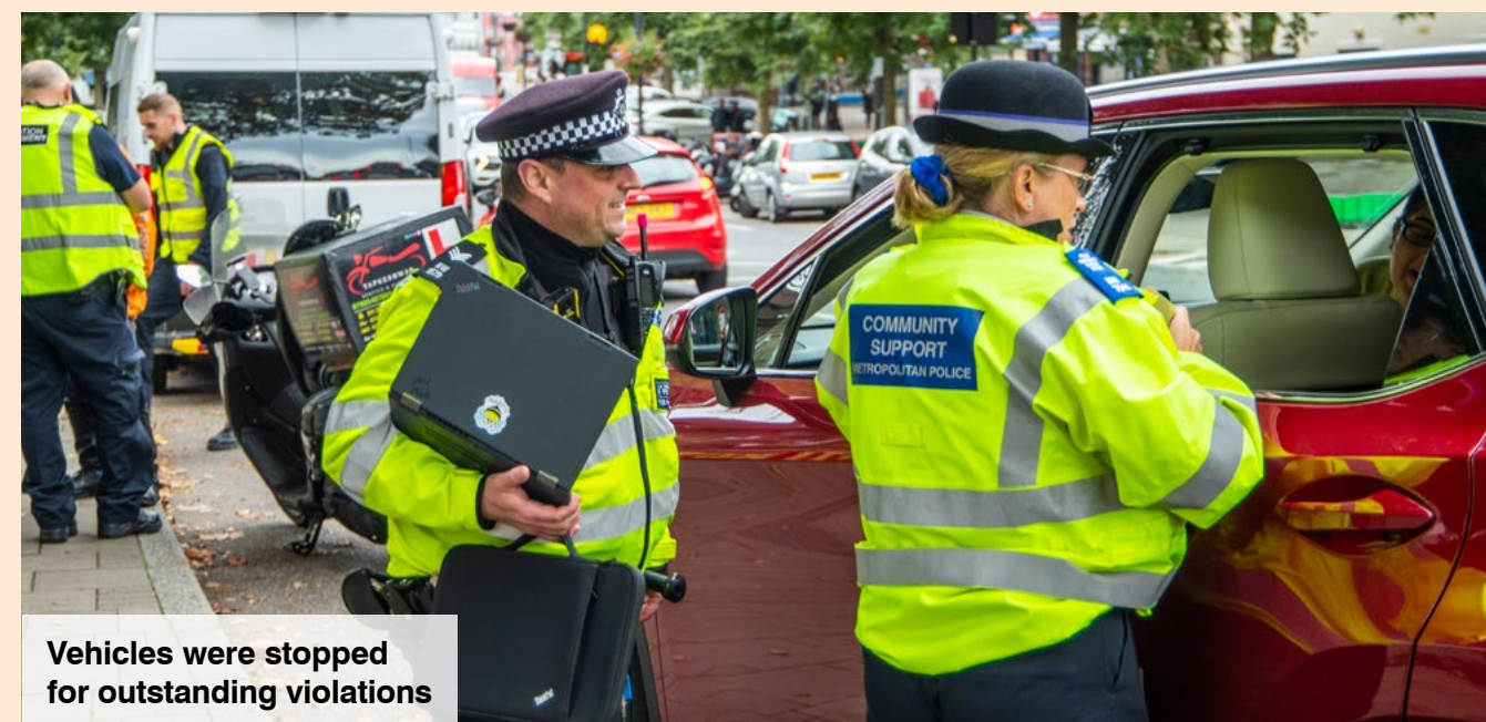
Vehicles were stopped for outstanding violations

Another successful Day of Action saw council, police, fire brigade and other local partners take part in a coordinated effort to clean up Rayners Lane.